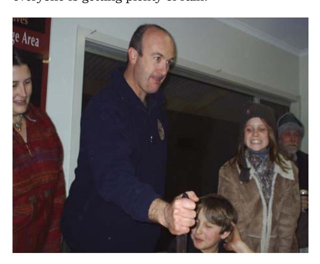
Editor's Note : Our President recently suffered another birthday. He is pictured above in a state of complete psychosis attacking his cake at his birthday party at Naracoorte. The image was sent to me from a 'wishing to remain nameless' source...

I hope the winter is not too quiet visitor wise and everyone is getting plenty of rain.